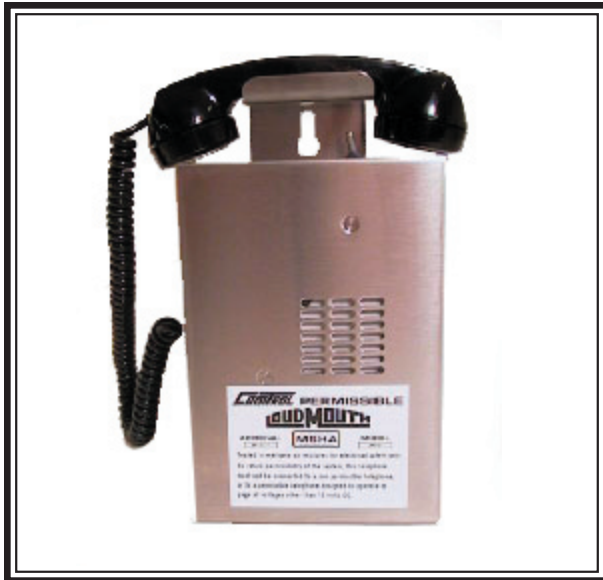
LM1515 LoudMouth - Permissible