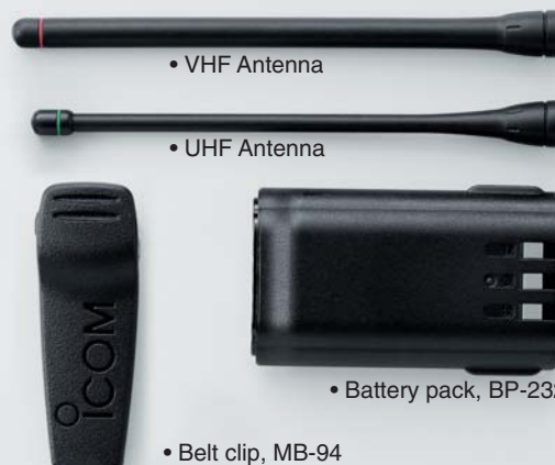
• VHF Antenna